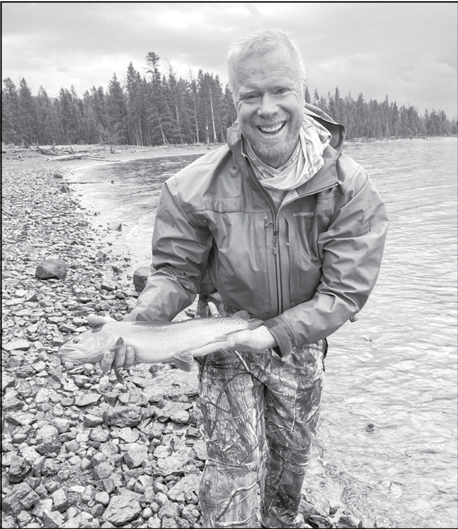
Big Yellowstone Cutthroat

If you want to explore the wilderness on your own two feet, but need a little help with your gear, we have you covered! We will pack your gear and food in on horses, plus set up a nice camp for you. We offer the same great meals and services as our horseback trips. We can travel as little or as far as you would like to go! You will enjoy the quietness of the mountains and exploring the wilderness with friends or family. We will meet you at per-arranged destinations where camp will be waiting for you. These trips vary from 2 to 10 days. GPS required.