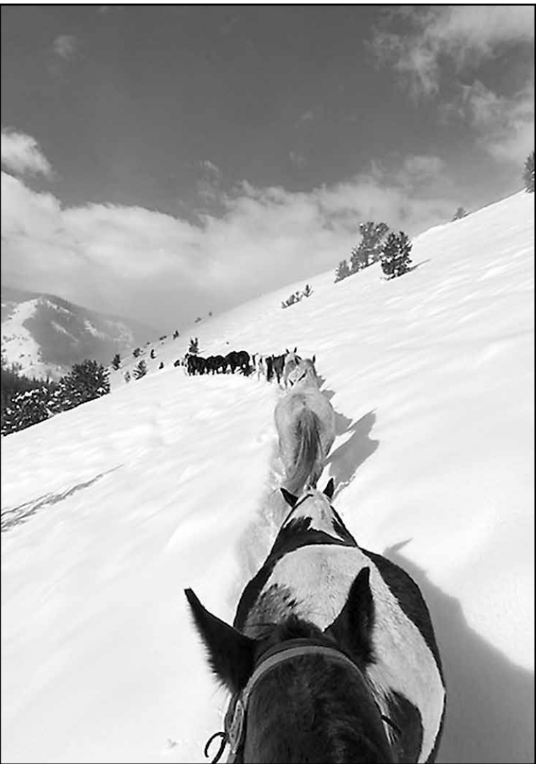
Trailing horses back to camp.