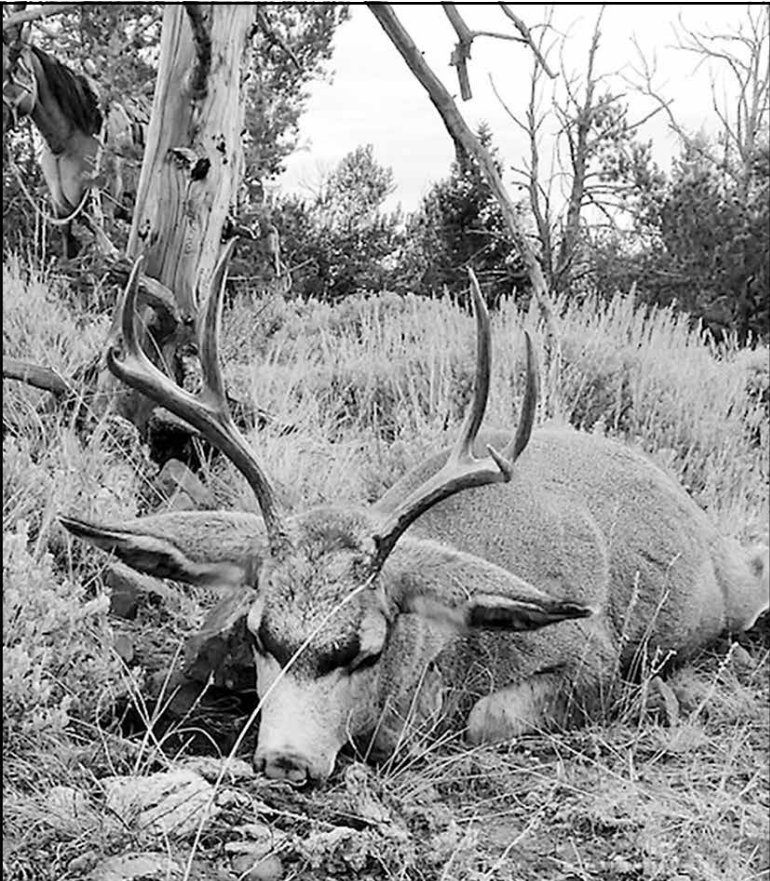
Nice mule deer buck.