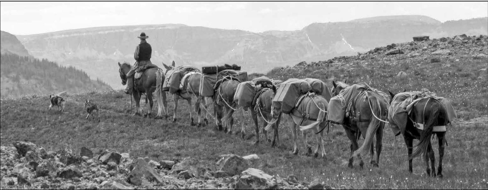
Going over the Buffalo Plateau.