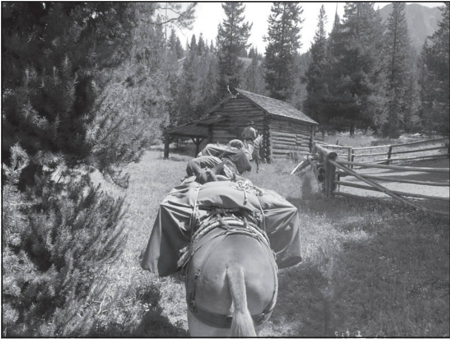
Most remote cabin in the lower 48 states.