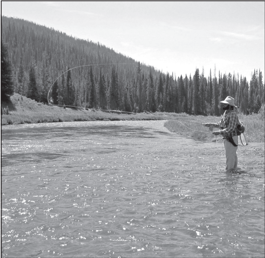
Fly fishing the Buffalo Fork.