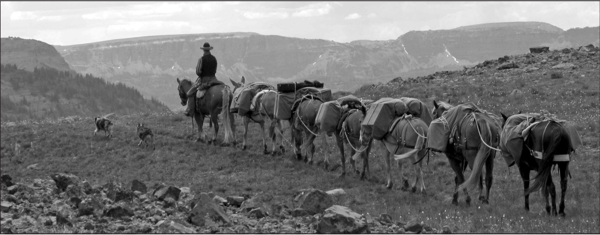
Going over the Buffalo Plateau.